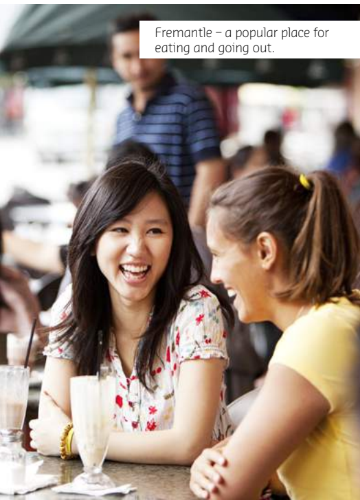
Fremantle – a popular place for eating and going out.

With an excellent standard of living, Perth is more affordable than Sydney, Melbourne, Brisbane and Adelaide. It offers the qualities and amenities of an international city in an idyllic, laid-back setting.