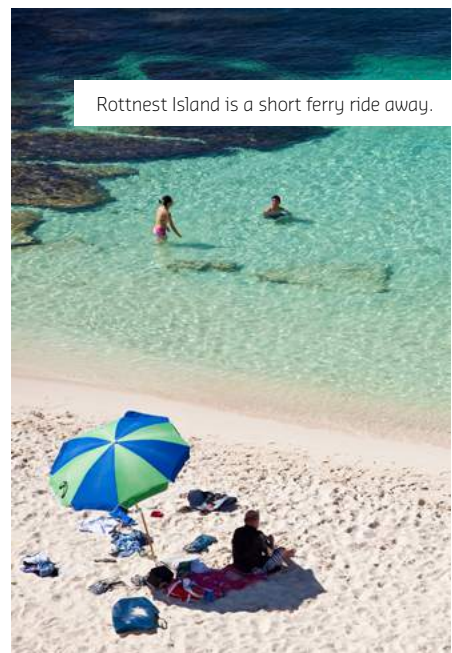
Rottneet Island is a short ferry ride away.